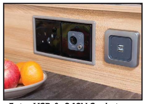
Extra USB & 240V Socket

We believe that the AL-KO ATC is the best caravan stabilising safety system available today. Sensors monitor for instability during towing. The ATC automatically applies the caravan brakes stabilising the outfit quickly and safely.