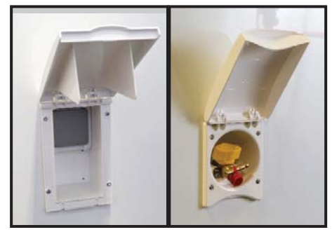
External 240V & BBQ Point