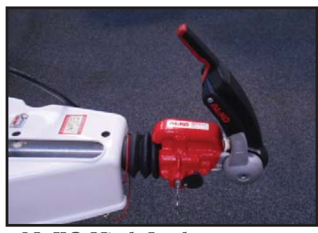
AL-KO Hitch Lock