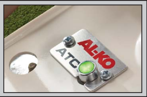
ATC- Automatic Trailer Control

We believe that the AL-KO ATC is the best caravan stabilising safety system available today. Sensors monitor for instability during towing. The ATC automatically applies the caravan brakes stabilising the outfit quickly and safely.