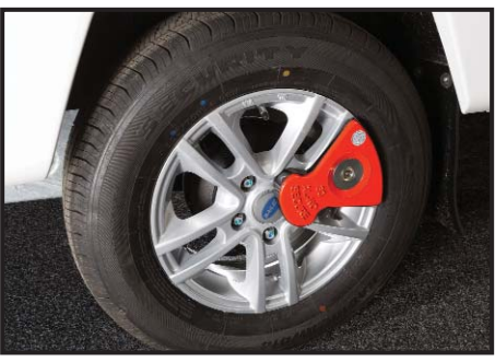
AL-KO Secure Wheel Lock